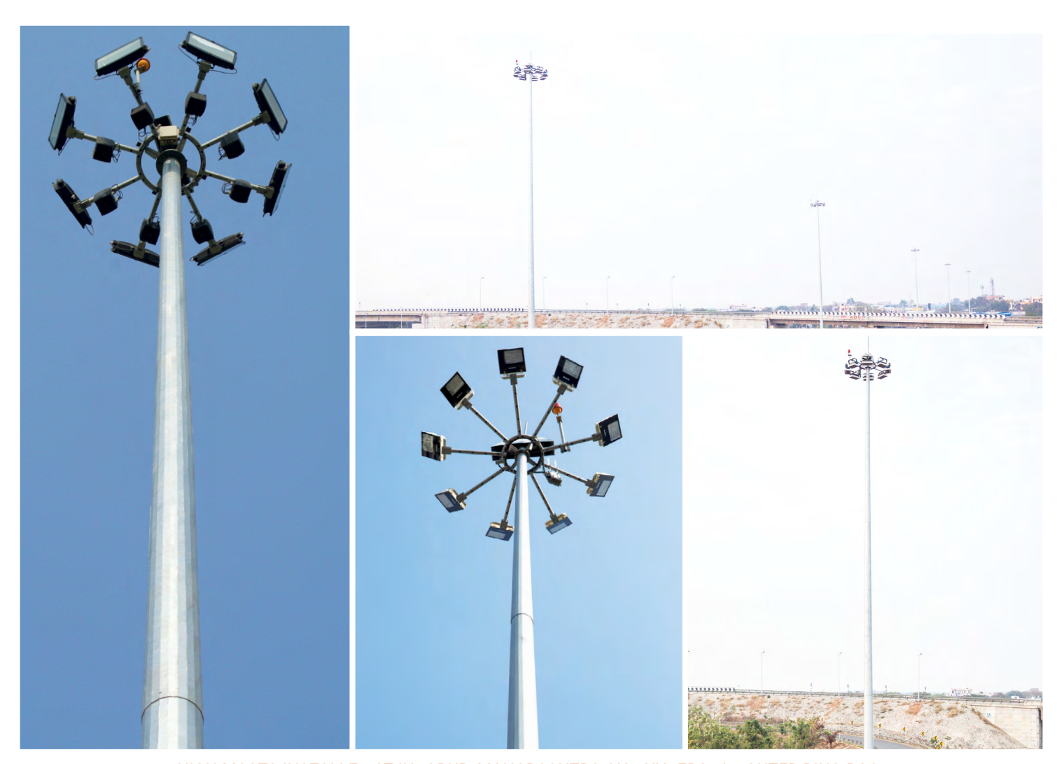
HIGH MASTS INSTALLED AT INDAPUR, MAHARASHTRA AND HYDERABAD OUTER RING ROAD

For roadways, ports and other industrial areas that require high-mounted light structures, Valmont's tapered steel high masts are the superior solution.