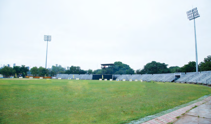
(TOP) MOHALI STADIUM, CHANDIGARH; (BOTTOM) 40M MASTS AT TIRUNELVELI, NATHAM SUPPLIED FOR TAMIL NADU PREMIER LEAGUE