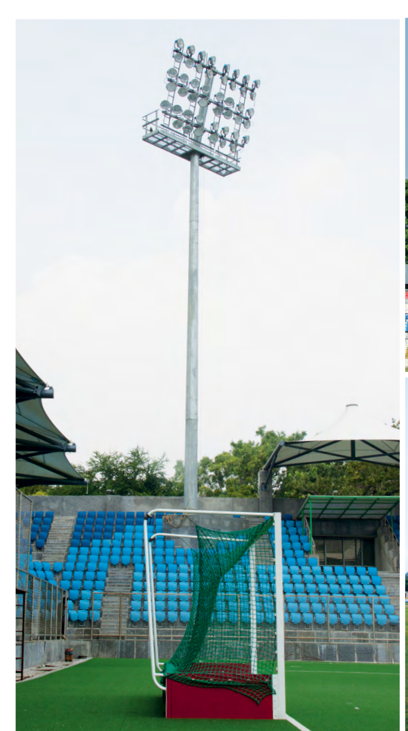
40M MASTS AT ISL RABINDRA SAROVAR STADIUM, KOLKATA

For more than 40 years, Valmont has offered steel and aluminum structures to meet the most demanding sports lighting requirements. Our engineering capabilities are what set us apart from the competition.