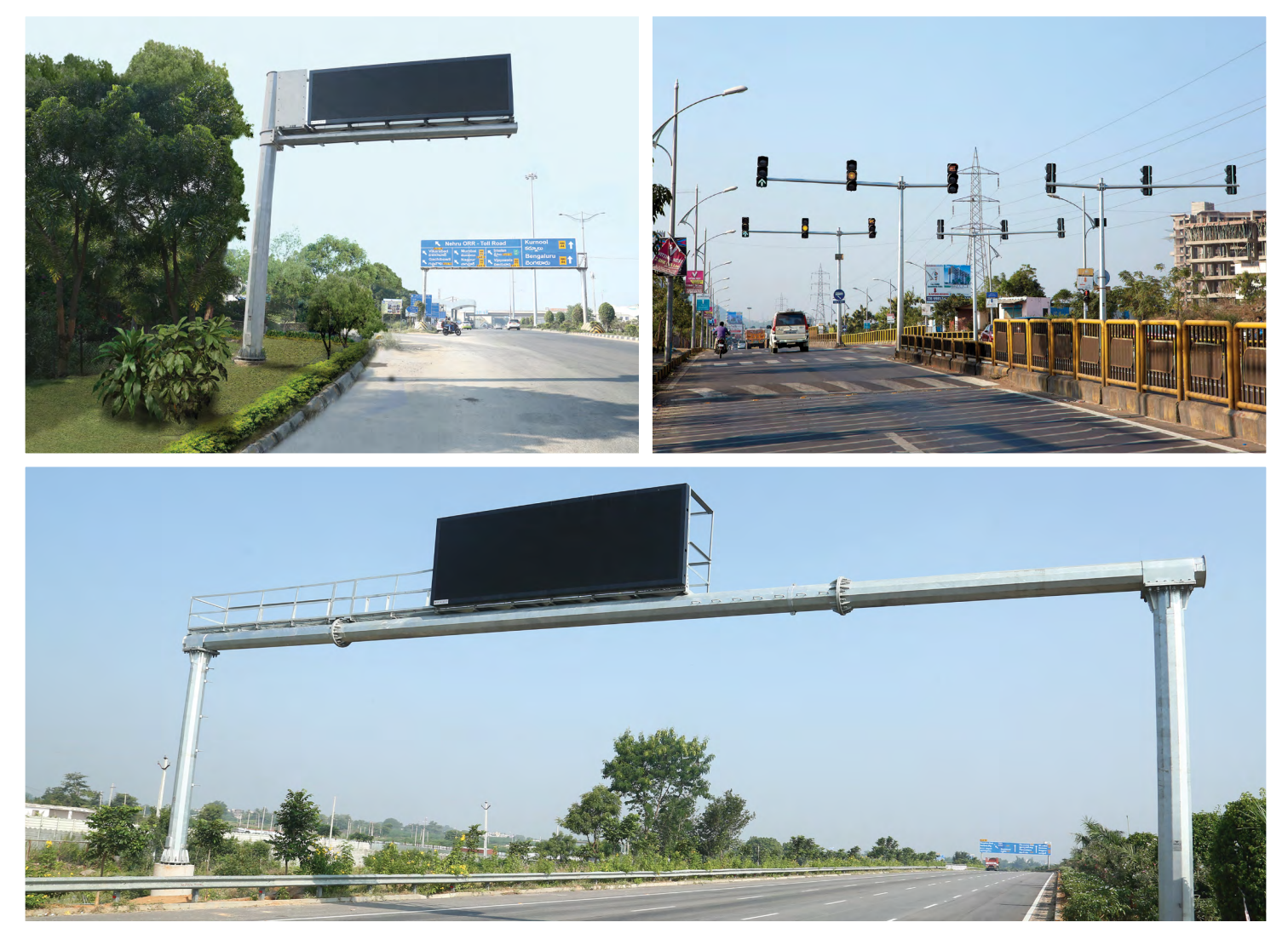
(TOP LEFT) F-TYPE CANTILEVER INSTALLED AT HYDERABAD OUTER RING ROAD; (TOP RIGHT) TRAFFIC SIGNAL STRUCTURE INSTALLED IN PUNE & (BOTTOM) GANTRY INSTALLED AT HYDERABAD OUTER RING ROAD

Everyday, you work hard to make India's roads safer. We do, too. Our commitment to safer roads has made Valmont<sup>®</sup> a leader of engineered support structures.