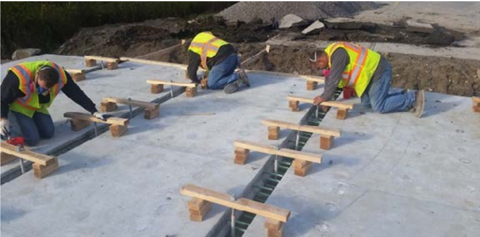
Forming deck joints for Transpo T-17 methacrylate polymer concrete deck joint

The deck for Structure 4-08 was overlaid with a thin epoxy overlay to further protect the concrete driving surface. Due to weather limitations the thin epoxy overlay on Structure 4-09 was placed the following spring under temporary lane closures.