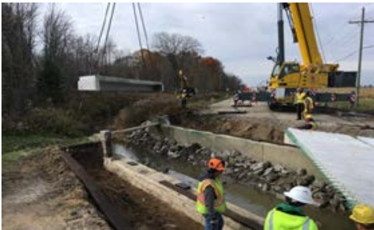
Shipping and setting the Valmont Bridge System