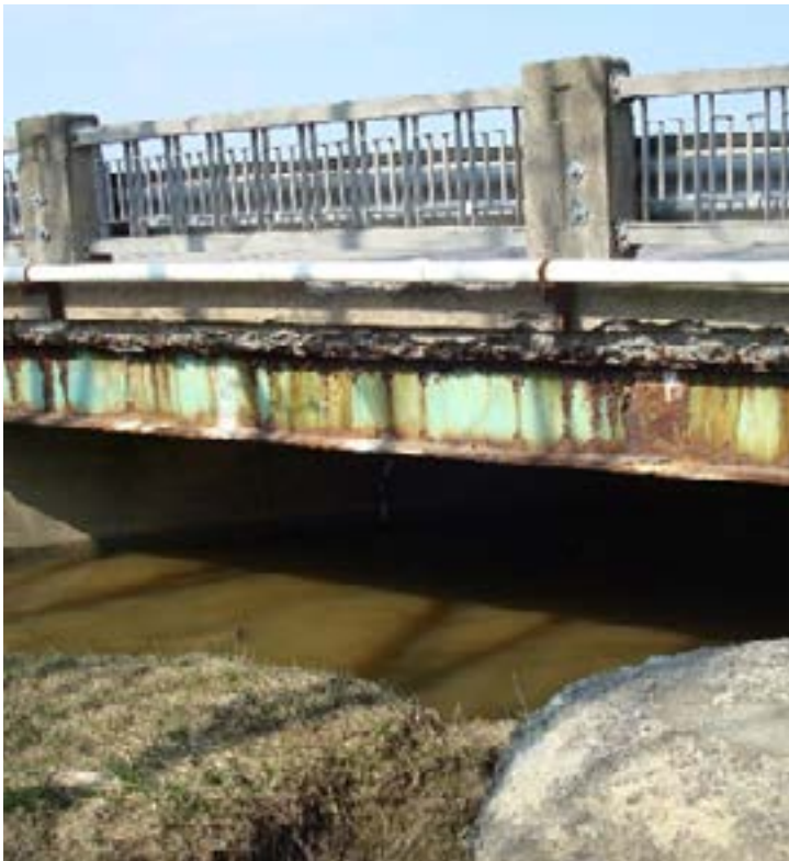
Existing bridges on Marine City Highway