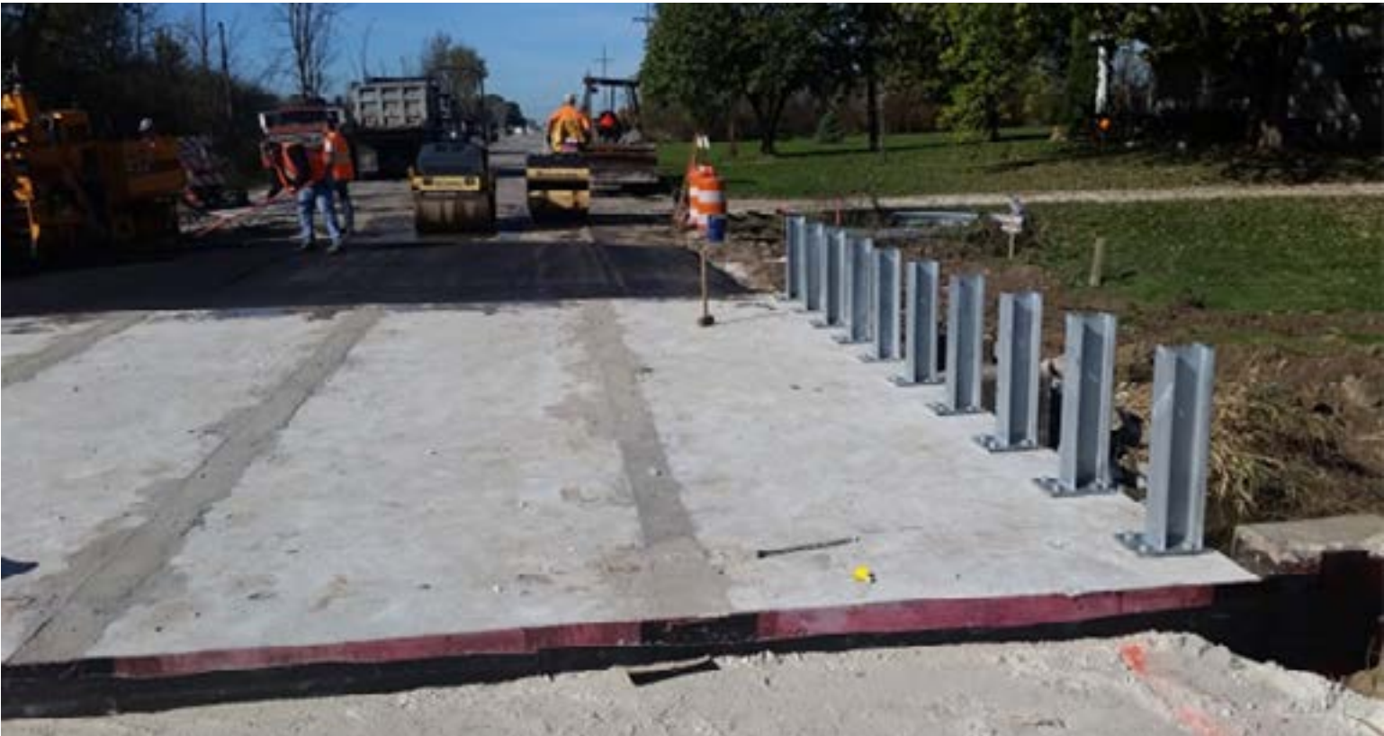
Units connected with a high performance concrete deck joint pour