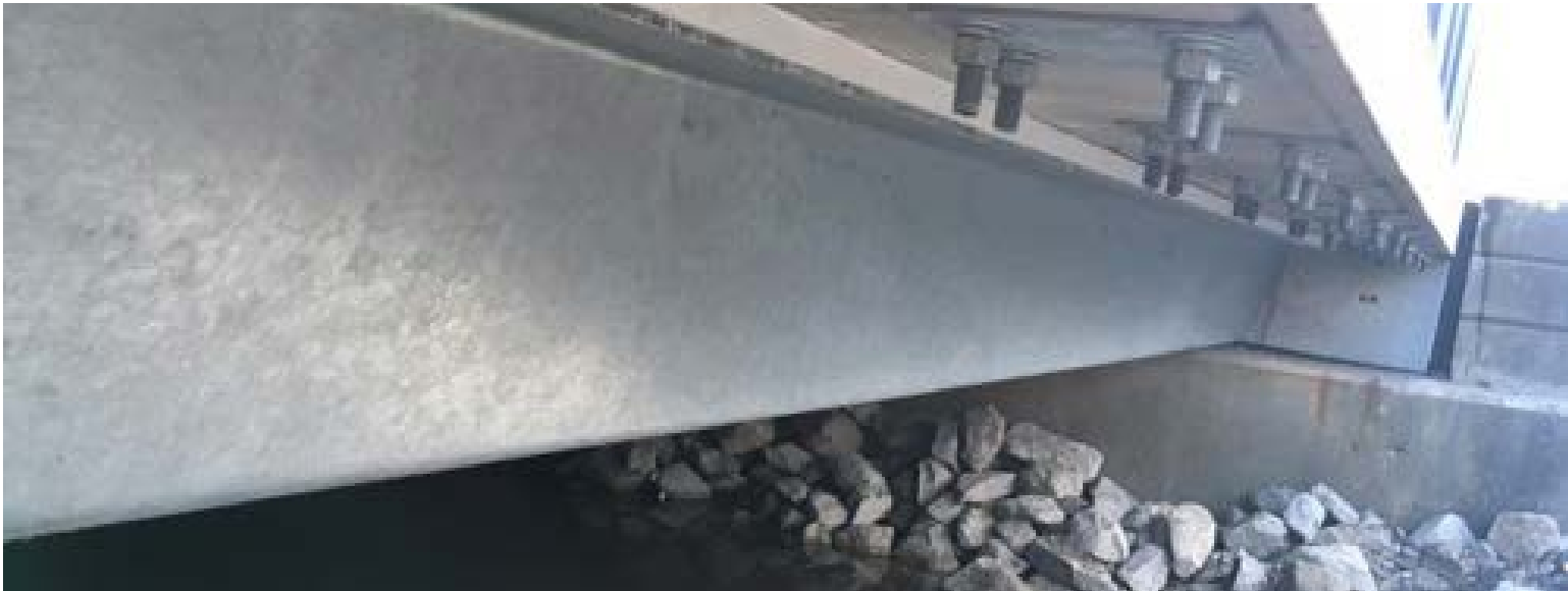
Complete bridge on Marine City Highway