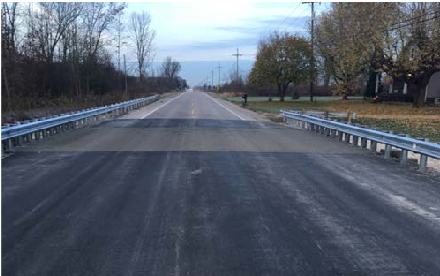
Complete 4-08 Marine City Highway Bridge with epoxy overlay