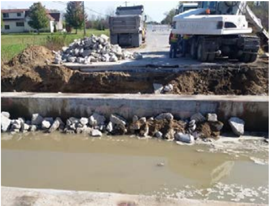
Existing abutments were reused and rehabilitated