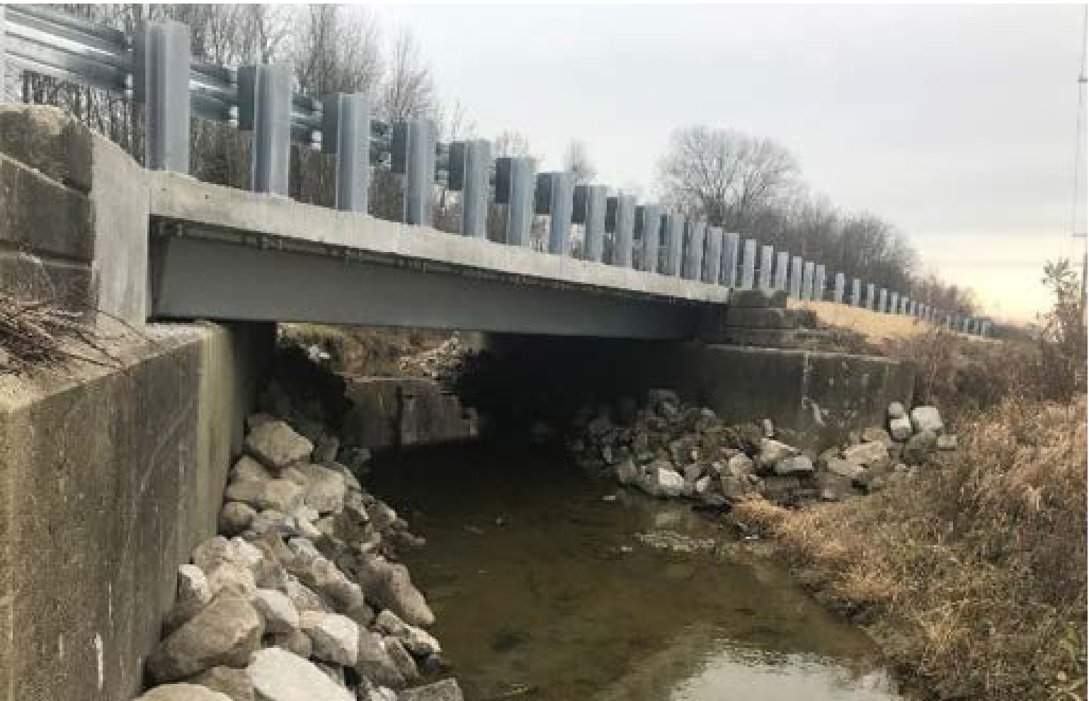
Complete bridge on Marine City Highway

Or contact Valmont Structures at (402) 359-2201.