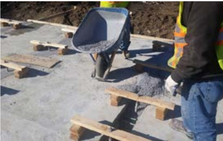
Forming and grouting deck joints