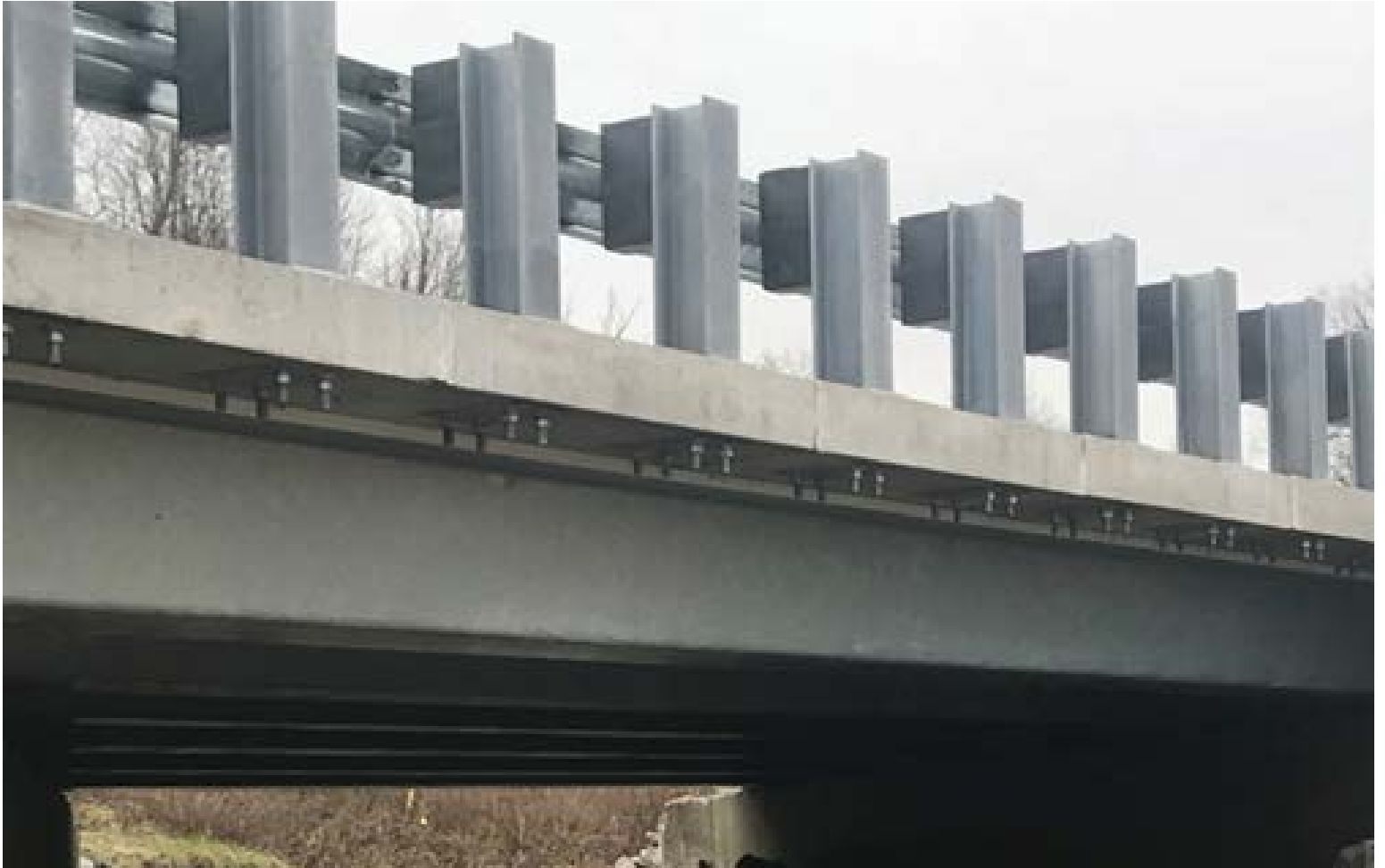
Valmont Bridge System installed in St. Clair